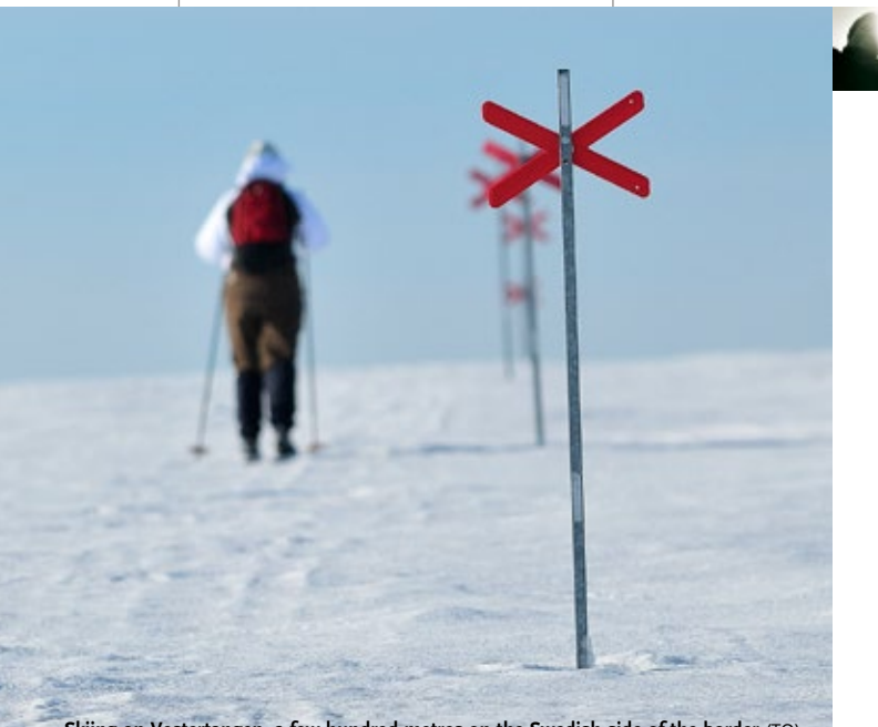
Skiing on Vestertangen, a few hundred metres on the Swedish side of the border (TO)