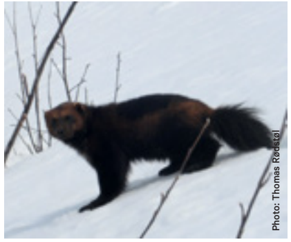
The wolverine - small and hardy.