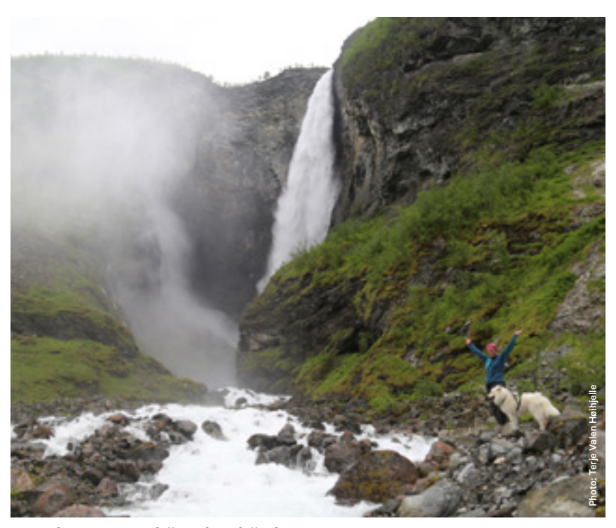
Vettisfossen water fall - a free fall of 275 metres.