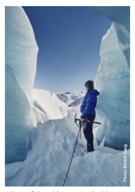
A beautiful world awaits in the blue ice.