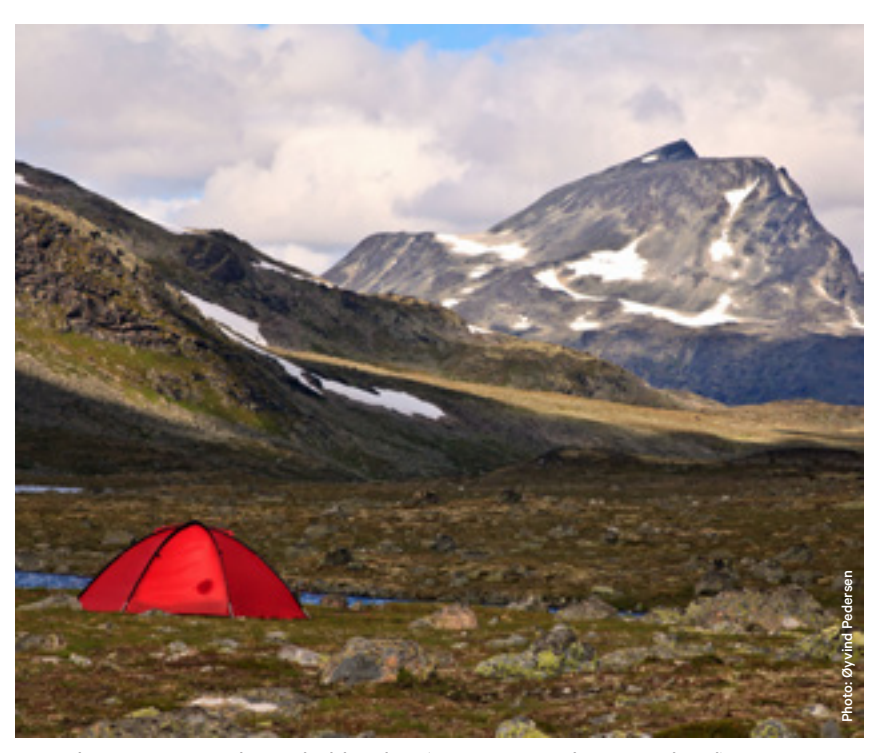
A mighty view towards Snøholdtinden (2141 metres above sea level).