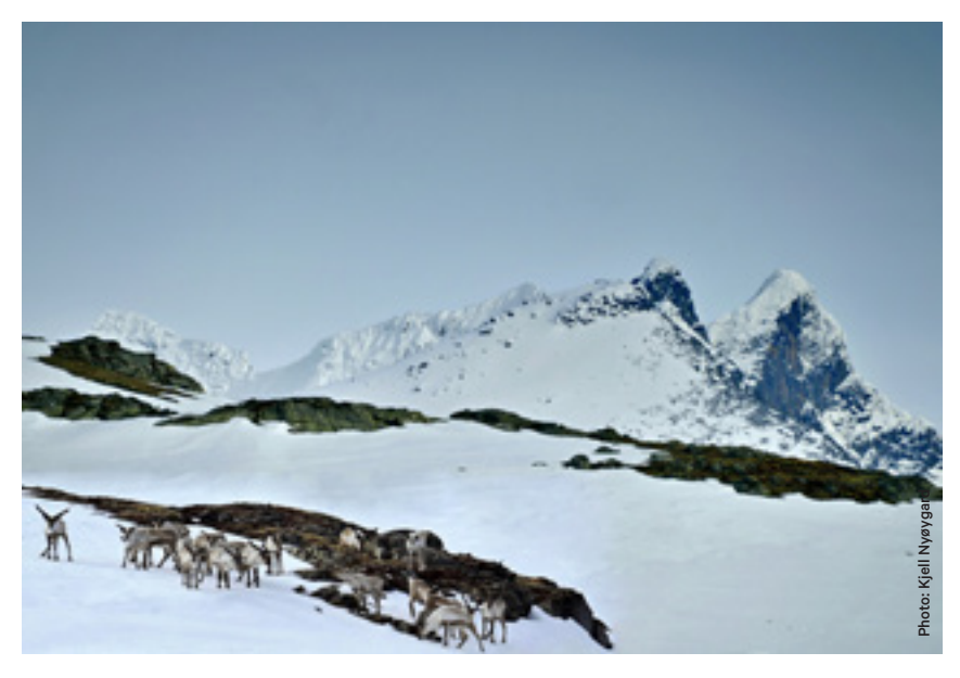
Underneath snow clad peaks the wild reindeer find pastures in wind blown rocky areas.