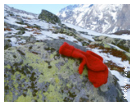
Yellow map lichen decorate the mountain.