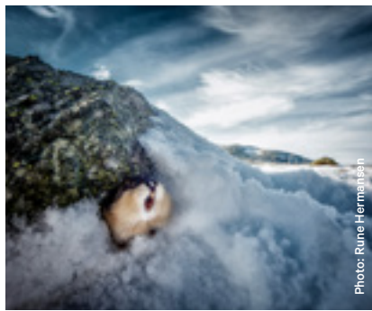
A vital element in the mountain: Lemming.