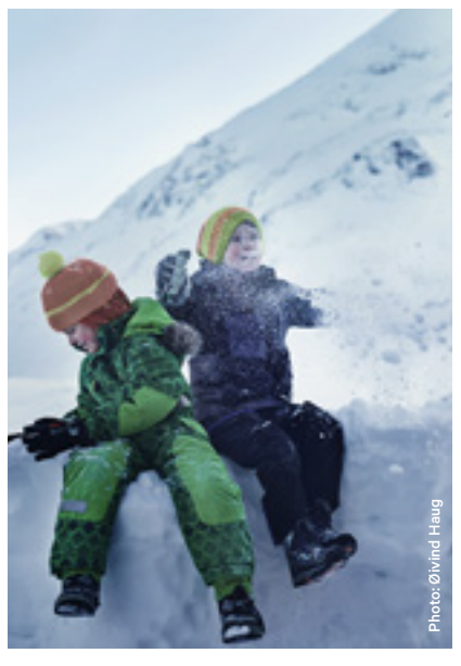
Let the kids experience Jotunheimen!