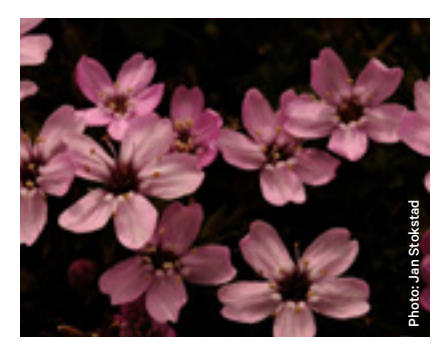
Moss campion or cushion pink grows in tight little cushions.

The map lichen is a common species in Norway. Since the map lichen does not survive under ice, we can look at the size and calculate how long an area has been free of ice. The map lichen is slow growing: If the plant has a diameter of five centimetres it means that it is approximately 250 years old. The lichen starts to grow as soon as snow and ice no longer cover the stone all year round. A lighter coloured scree without lichen has therefore been free of ice for a shorter time than a lichen covered scree.