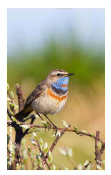
The bluestocking can imitate other bird species.