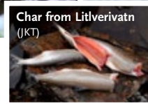
Char from Litlverivatn (JKT)

The animal and bird life in the national park is not particularly rich. The elk is the only wild representative of the deer family which lives permanently in the area. Along with semi-domesticated reindeer, which mainly graze here in winter, the area provides a source of food for resident wolverines. Beavers were released in Storskogdalen in 1968, but are now extinct, although traces of their former activity can still be seen.