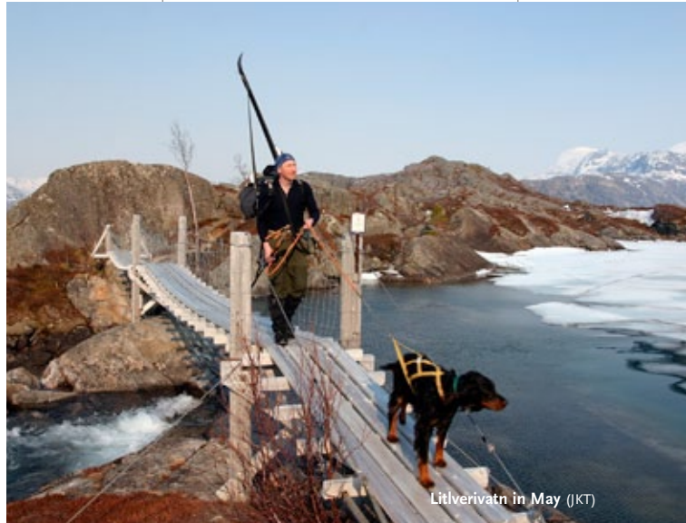
Litlverivatn in May