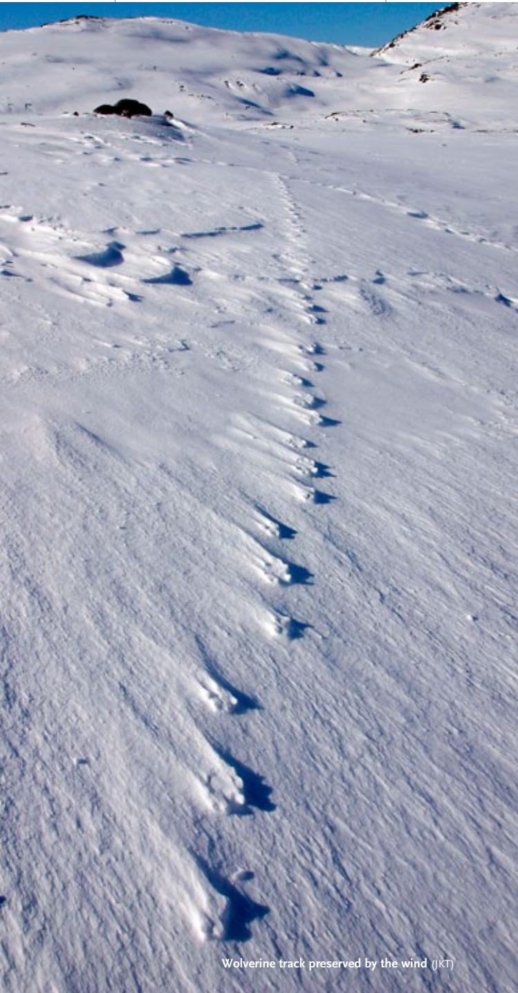
Wolverine track preserved by the wind (JKT)