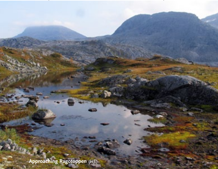
Approaching Ragotoppen (HE)