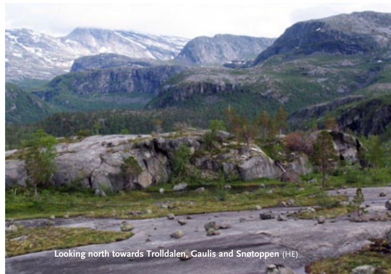
Looking north towards Trolldalen, Gaulis and Snøtoppen (HE)

Unlike the adjacent Swedish national parks, Rago has a typical coastal climate with a great deal of precipitation, relatively cool summers and mild winters.